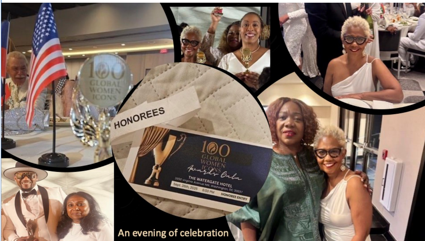
An evening of celebration